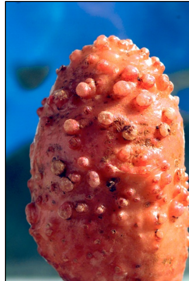
Figure 3. “Pimples” on potatoes due to gall development of M. fallax .