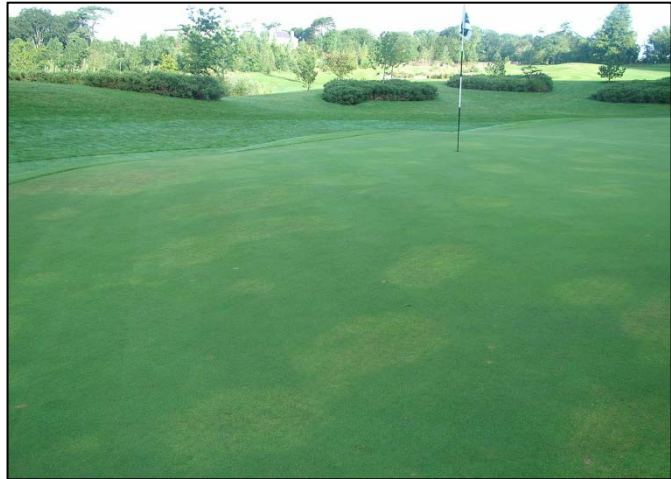
Figure 6: A golf course green infested with M. minor . Symptoms are similar to those of M. fallax infestation.

Meloidogyne species are among the most important plant-parasitic pests in worldwide crop production. Crop losses from nematode damage alone are estimated at 10 to 11% worldwide, but this is thought to be an underestimate. If unregulated, nematode related crop losses to potatoes grown in the Northwest region of the United States could be as much as $40 million (Davis and Venette, 2004). The economic impact of M. fallax alone is difficult to measure because this species frequently occurs in mixed populations. As a result, it is possible to ascribe nematode damage within a field to Meloidogyne sp. in general but not M. fallax alone. Due to its large host range of M. fallax across monocot and dicot plant species, there is also potential for this pest to disrupt the ecosystem function in the environments that support the affected host (Davis and Venette, 2004).