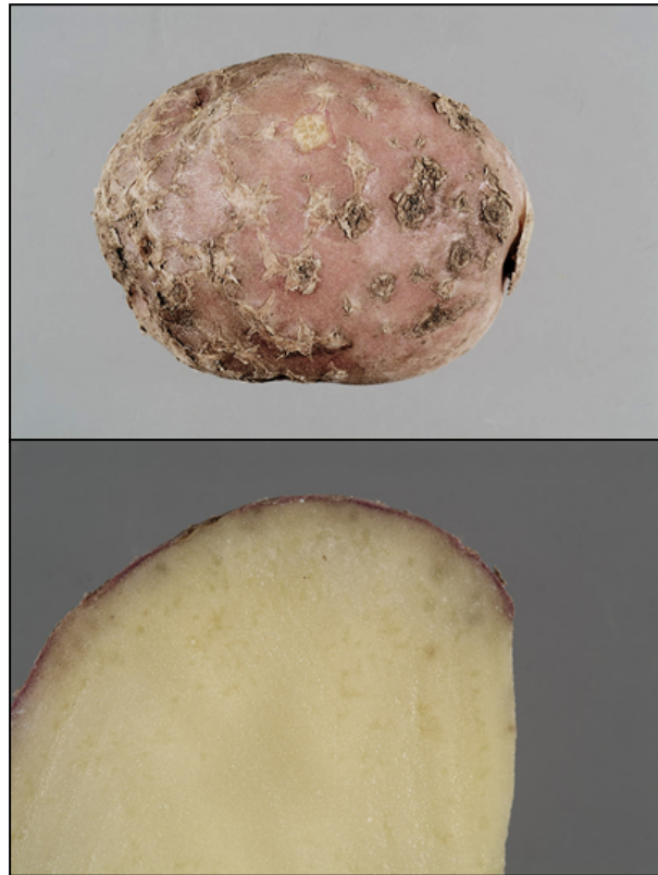
Figure 2. Symptoms of M. fallax on potato.

Males: Males are 1.171 \text{ mm} \pm 0.193 \text{ mm} in length. Other measurements include 0.036 \text{ mm} \pm 0.002 \text{ mm} in diameter at the widest point, a head region height of 0.046 \text{ mm} , a stylet length of 0.019 \text{ mm} , spicules that are 0.026 \text{ mm} \pm 0.002 \text{ mm} long, a gubernaculum 0.007 \text{ mm} in length, and testis 0.0496 \text{ mm} \pm 0.144 \text{ mm} in length.