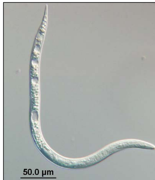
Figure 1: Photomicrograph of a J2 M. fallax nematode.

The J2 body is moderately long and vermiform, with tapering at both ends, but the taper is more pronounced on the posterior end (Fig. 1). The body annules are small but distinct. The lateral field has four incisures that are not areolated. The head region is truncated and slightly set off from the shaft. The cephalic framework is weakly sclerotized with a distinct vestibule extension. The stylet is slender and moderately long